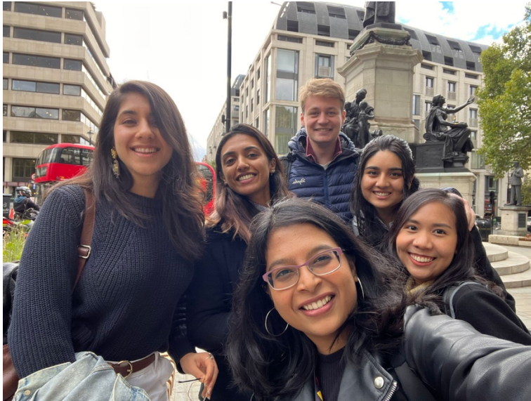
With some new friends at the LSE, after our first day of lectures!